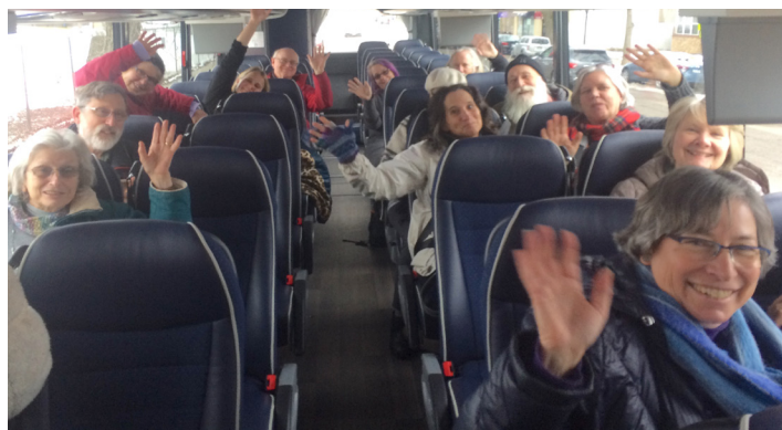
QEW at our Steering Committee Meeting in April 2019.

We are dedicated to a spiritual transformation within the Society of Friends with regard to our connection with the natural world. We work toward that transformation by continually seeking the Light in all our endeavors and depending on the testimonies and Friends' process in our work. Thank you for being on this journey with us!