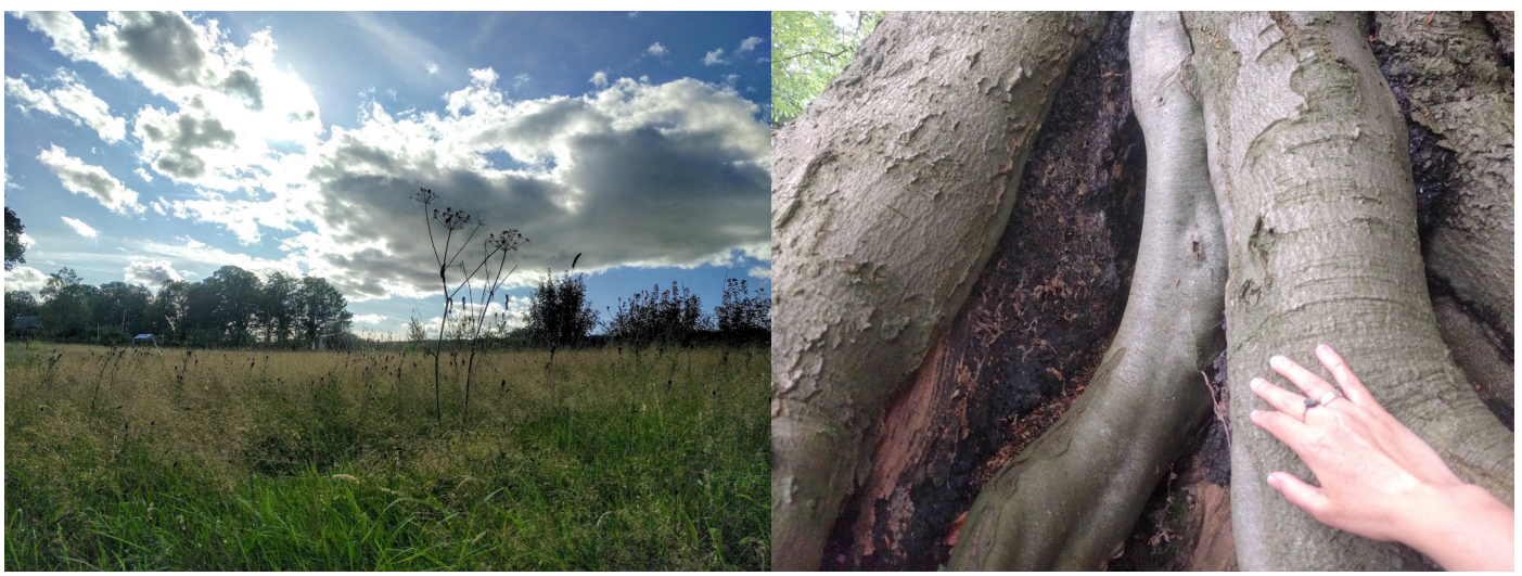
Photo: Mey Hasbrook documents her visits with the trees, roots, and meadows of Swarthmoor Area Meeting of Southwest Cumbria, England