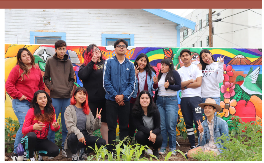
Los Angeles community garden supported by AFSC's Roots for Peace program.

For over 40 years, AFSC has had international and U.S. based programs that support farming to bring peace and economic, social, and environmental justice. Growing food is a practice that land-based people