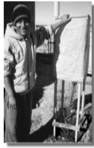
Protective covers are key to El Alto Church's strategy for high-altitude forestation.

Other benefits included a use for compost generated on the Meeting House property and educational opportunities for the First Day School children. Many members of the Saratoga Springs Meeting were involved or made contributions.