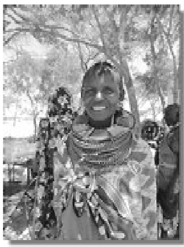
Traditional Kenyan woman choosing family planning