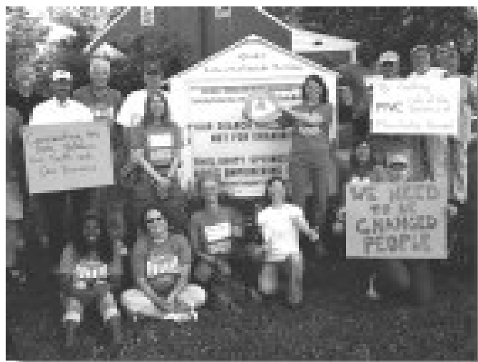
Lancaster (Pa.) Friends join the campaign to cut mountaintop removal companies' purse strings.

For more about EQAT and mountaintop-removal coal mining, go to: < www.eqat.org >.