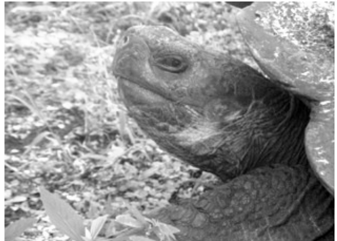
A Galápagos tortoise.

There is hope for endangered species, at least in the Galápagos. Efforts to protect their endemic hawk have apparently been successful because recent population estimates suggest that there are now almost 2,000 members. There are even plans to reintroduce them to islands where they have been driven to extinction. I feel good that our small contributions paid for by the permits to enter the islands have been effective in helping to preserve one of the wonders of nature. ♪