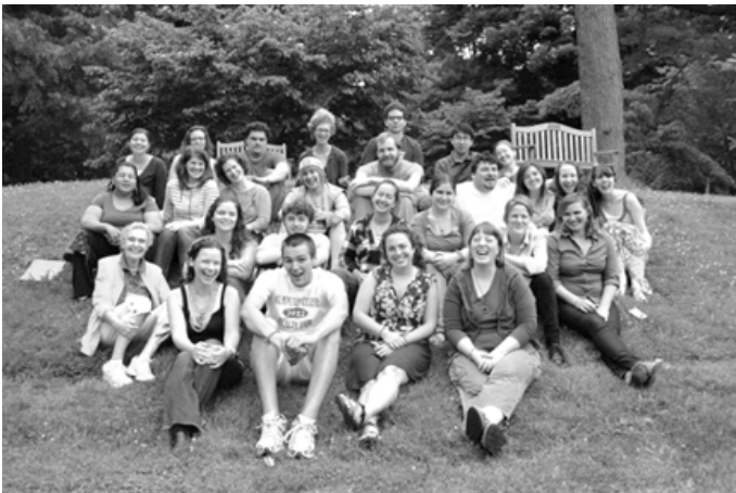
Young adult Friends gather for a group picture at the 2012 conference.

This year’s conference, “Continuing Rev_l_tion,” will be held at Pendle Hill from June 14-19, 2013 and will focus on the Simplicity testimony, following a similar format and structure to the 2012 conference. Young adults from around North America will be invited to come to Pendle Hill for six days of programming, including speakers, workshops, silent and programmed worship, creative expression opportunities, skill-building activities, and fellowship. The program itself is still in development, but our plan to focus on simplicity will allow us to use that important Quaker testimony as a lens through which we can examine all personal, communal, and global implications of living in the world, not of the world. We hope to bring 40-45 young adults to Pendle Hill for another successful year of Continuing Rev_l_tion.