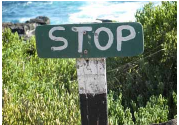
Tourist access to the islands is strictly limited: paths are clearly marked, with frequent “STOP” signs. They could be taken as cogent messages for our culture.

The marine iguanas captivated our imaginations as did no other Galápagos creature. From their lost origins, they have adapted as seven distinct subspecies on eight different islands ranging from Fernandina, the