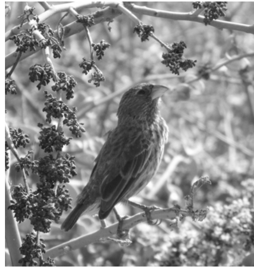
One of Darwin's finches, probably a Vegetarian Finch ( Platyspiza crassirostris ).

The finches' minutely differing beaks are a key to