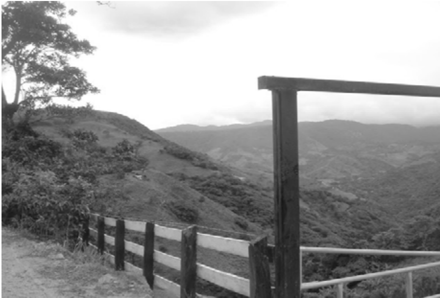
Finca La Bella is in the back of San Luis Valley, framed by the gateposts.