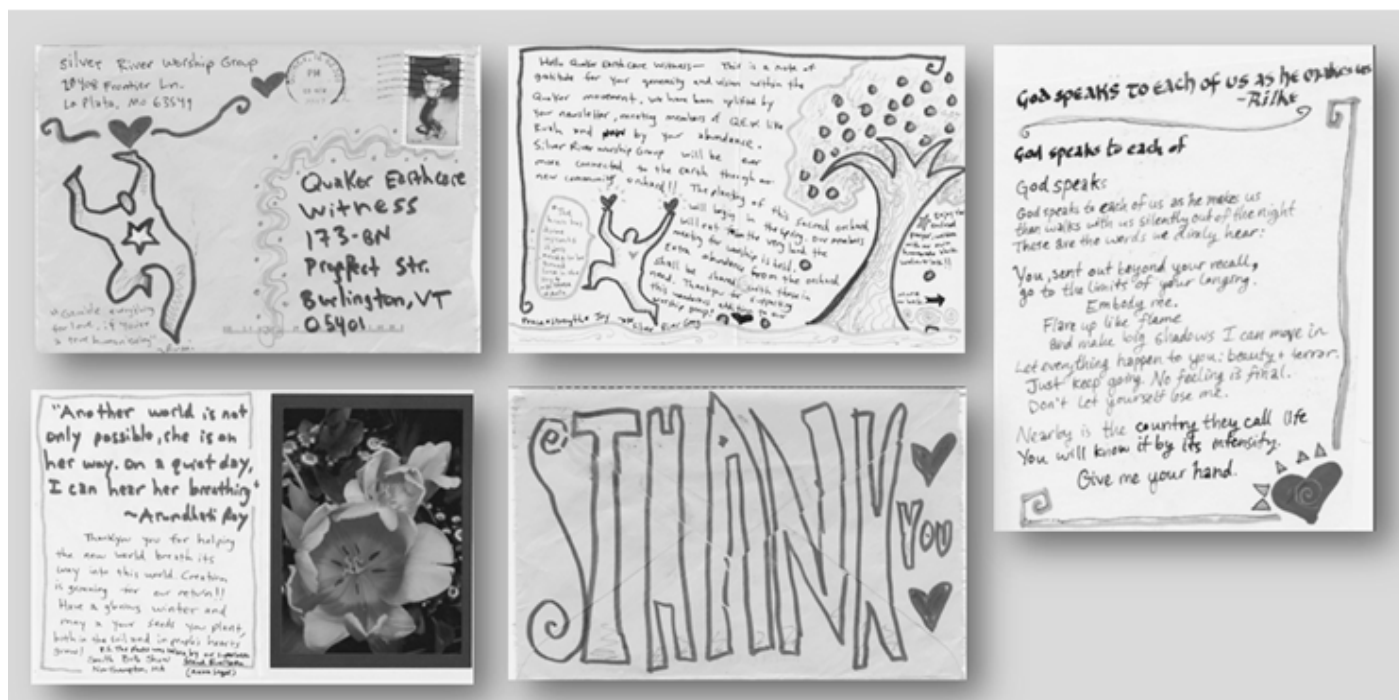
A five-page thank you note from Silver River Worship Group in La Plata, MO, sent November 8, 2012.