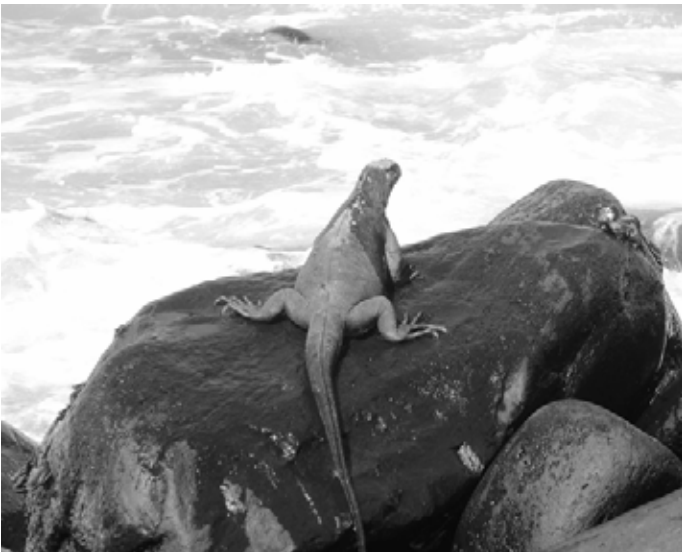
A marine iguana ( Amblyrhynchus cristatus ), gazing out to sea, with Sally lightfoot crabs ( Grapsus grapsus ).

efficiently on green algae, special endobacteria for digesting marine vegetation, and dark colors for absorbing enough sunlight to warm their cold blood after seafloor foraging. They learned to cooperate with finches and Sally lightfoot crabs who pick ticks, mites, and algae off their hides. They evolved to fill their own special niche and thus minimize competition. In doing so they face other risks, including powerful surf and playful sea lions. When a strong El Niño strikes and the algae die off in warming waters, marine iguanas also die, in catastrophic numbers. Such are the risks of adaptation and evolution.