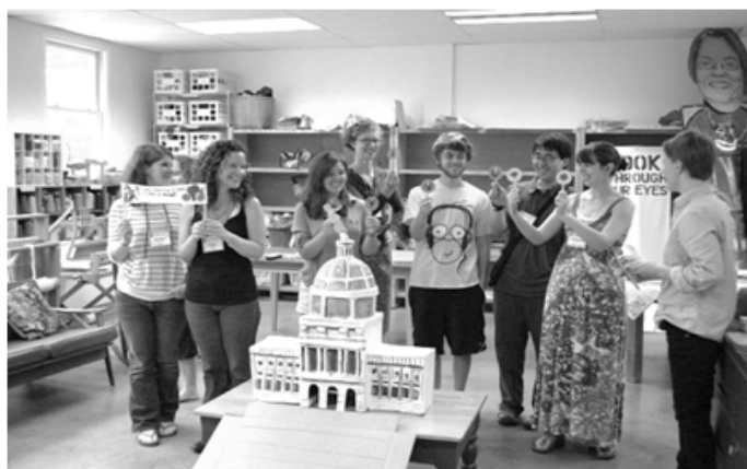
Making art for protests and marching on "Harrisburg capitol," with Spiral Q Puppet Theater.