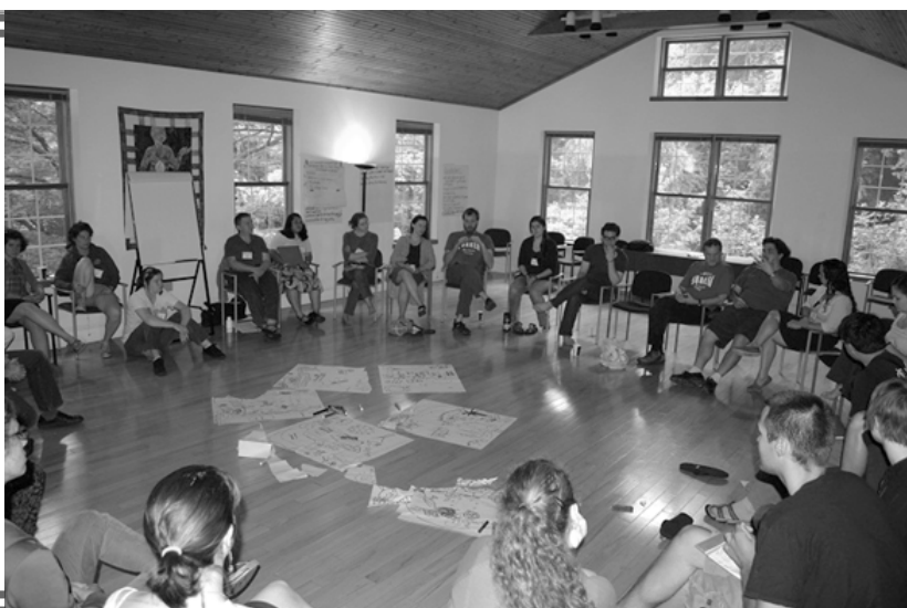
Learning how to be effective change agents in the world.

LAST SUMMER, PENDLE HILL, WITH CO-SPONSORSHIP from Quaker Earthcare Witness, the Pickett Endowment, and Willistown (PA) Monthly Meeting, embarked on designing an innovative and powerful six-day training-oriented program for young adult Friends who have an interest in social action and environmental justice. With the help of QEW's financial and programmatic investment, 30 young adults from across North America were able to gather together from June 15 to 21, 2012. Through worship, workshops, games, service, reflection, speakers, musicians, art, and fellowship, the young adult Friends dove into the weighty and complex work of creating a more just, sustainable, and spiritually connected world. The conference demonstrated the power of collaborative experiential learning and provided a model for a new and cutting edge approach to young adult Quaker programming.