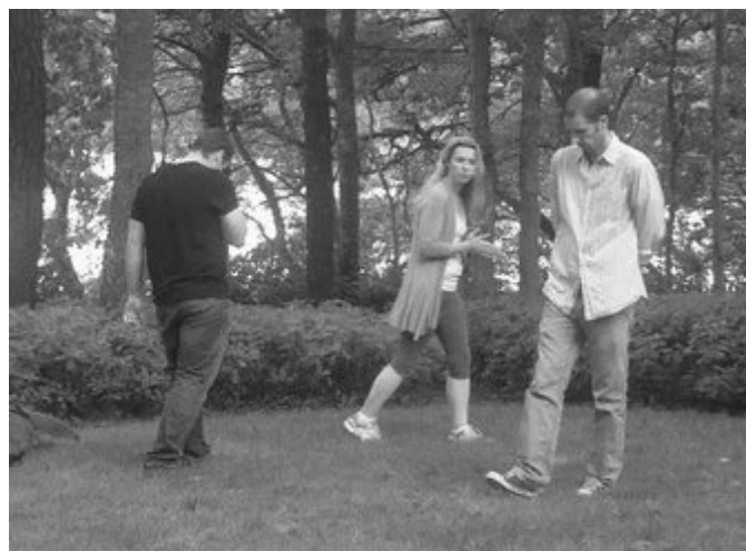
A rehearsal outdoors in Cape Cod for the Boston Greenfest presentation.