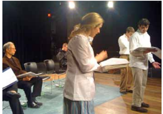
A reading of Act I at Cape Cod Community College in February 2011.

I spent the next year mostly acting and the following year directing, but when I got out of school, I realized it was playwriting that tapped the deepest into my desires and creativity. With a play called Art Deco for Emotional Cripples , I applied to eight MFA playwriting programs. A lesser known program gave me a full ride and a well-known program gave me no funding. I chose the middle ground and attended Brandeis University where