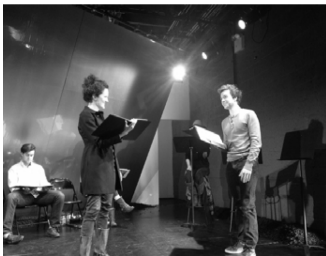
The Wild Project reading in New York in March 2013

I don't think I could have begun to confront the immensity of mountaintop removal, resource extraction, and climate change without the strength I received from a community of like-minded Friends and the guidance of Spirit. Though he's not a Quaker, early on I was really inspired by a speech by Bobby Kennedy Jr. and something he said: "To me, the environmental work is spiritual work -- we have a biological drive to consume the planet, to compete, and ultimately to destroy what God has created, and that can only be overcome with a spiritual fire. I don't think nature is God, or that we ought to be worshiping it as God, but I do believe it's the way that God communicates to us most forcefully." I agree with that. I left New York City in 2009 because I wanted a stronger relationship with nature and, for me, that also means a stronger relationship with God. ☞