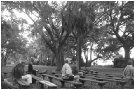
Early morning worship by the Lake.