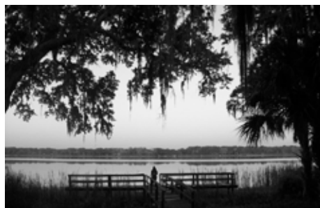
A beautiful, restful setting.