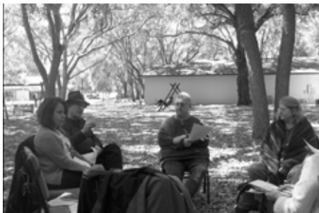
Sharing beneath the trees at SEYM.