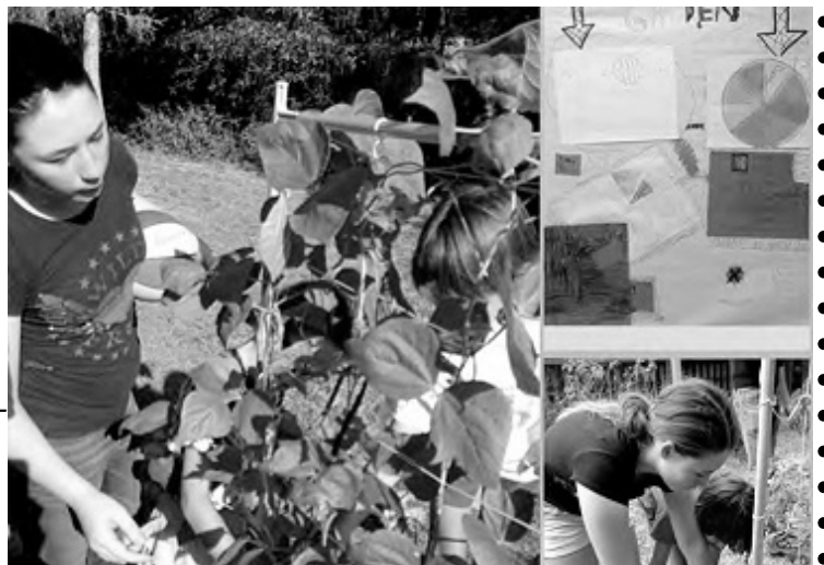
Sarasota, FL First Day School garden.

Our deadline for QEW Mini-Grant applications is May 2, 2014 . Questions? Call Bill Holcombe, Clerk, at (203) 313-4438 or send an email message to bholc7@hotmail.com . ∞