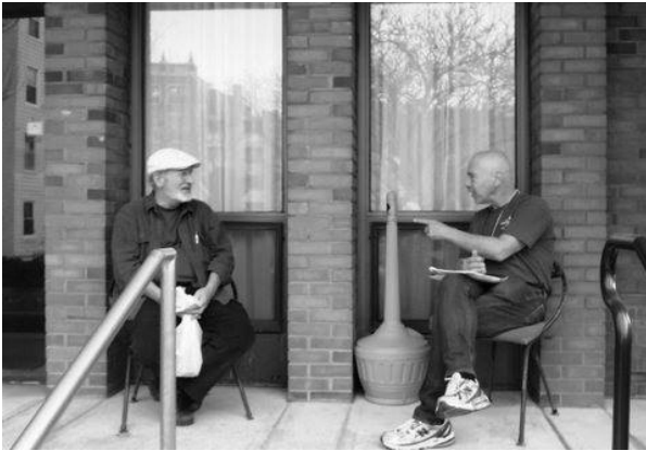
Conversations on the porch