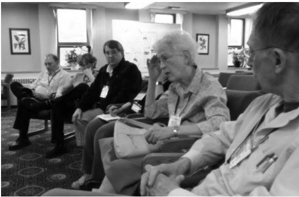
Together in group