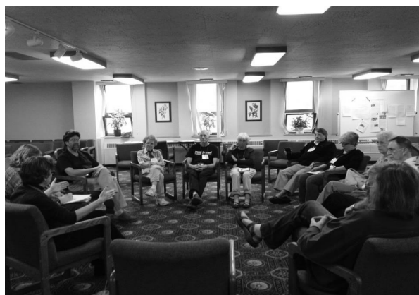
Conversations in circle