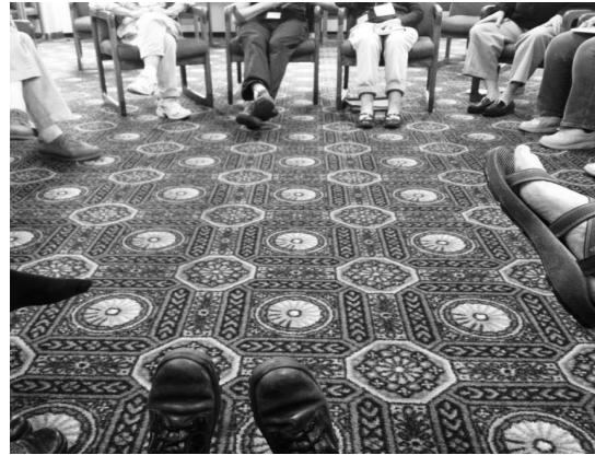
"Feet not in mouths"