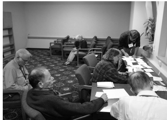
Sending cards to missing Friends