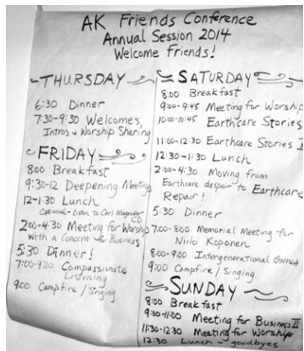
Yearly Meeting Program...look familiar?