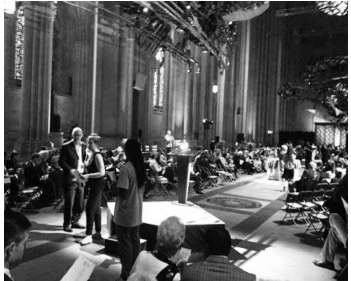
Paul Winter at St. John the Divine following the March.

The service included a welcome greeting, a review, and an array of faith-based reasons for caring for this gift that we have been given as creation. Commitments of care were given and affirmed throughout the service.