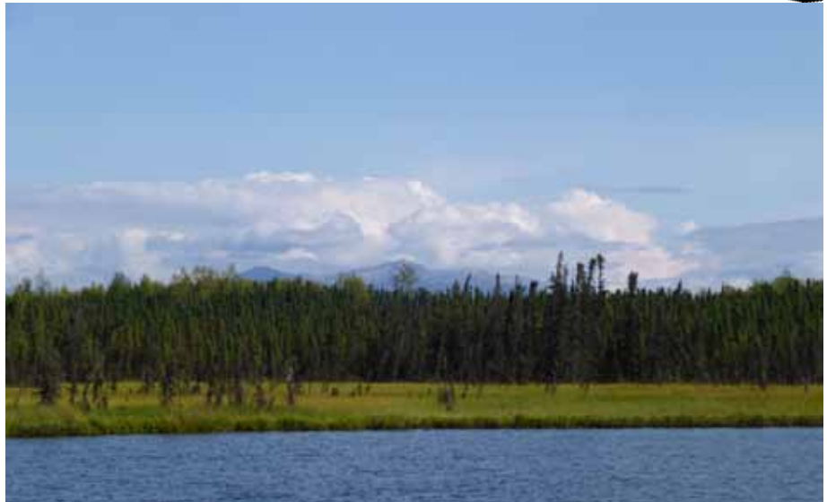
Dickerson Friends Center, near Wasila, AK.

More than many of us, most Alaskans understand that we are a part of the natural world. Our way of life must adapt to the vicissitudes of nature, not the other way around. Most non-native Alaskans moved to Alaska or stayed on because they value the natural resources and creative ways that people have traditionally lived in this beautiful and challenging environment.