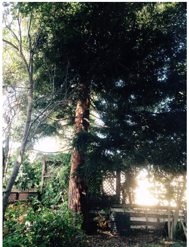
This 20 -year old redwood tree has grown to 80 feet tall in my backyard

In much the same way, people all over the world are hoping and praying for an historic agreement at the climate conference in Paris—the United Nations Framework Convention on Climate Change, November 30–December 11. But we