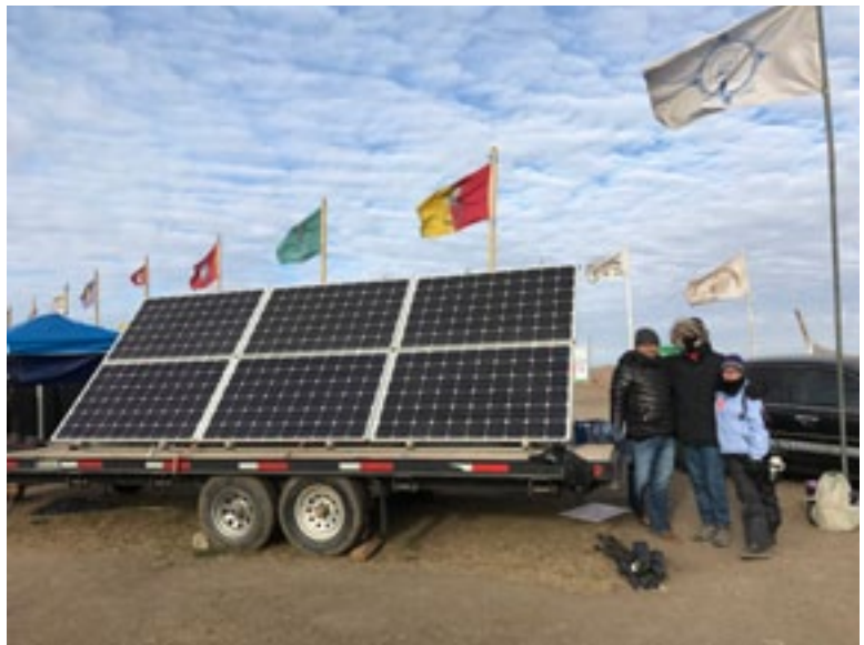
Solar panels at Standing Rock Reservation.

Digging even deeper, LCOE is a limited metric that ignores things like the environmental cost of different