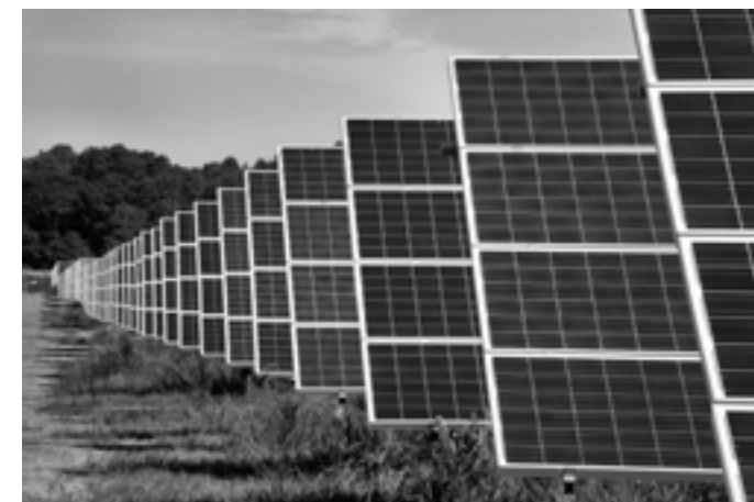
The Long Island Solar Farm is a 32-megawatt solar photovoltaic power plant in New York and is the largest of its kind in the eastern US, powering 4500 homes.

SOURCE: Roberts, David. “2 remarkable facts that illustrate solar power's declining cost.” Vox. December 22, 2016.