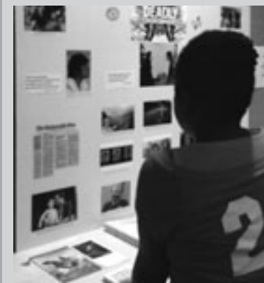
QEW's "Deadly Environment" presentation

Between 2002 and 2013, 908 people in 35 countries are known to have been killed because of their work on environmental and land issues.