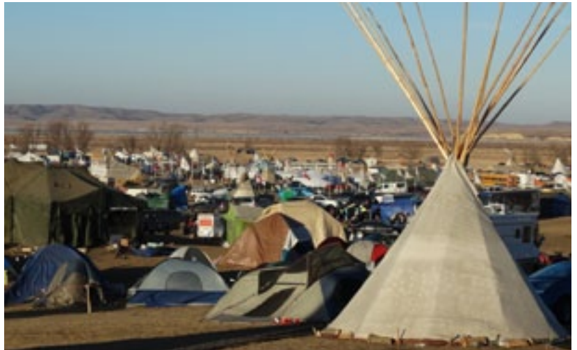
Standing Rock encampment, November 2016.

Now, in these past few months, we have witnessed another powerful spectacle that gained international