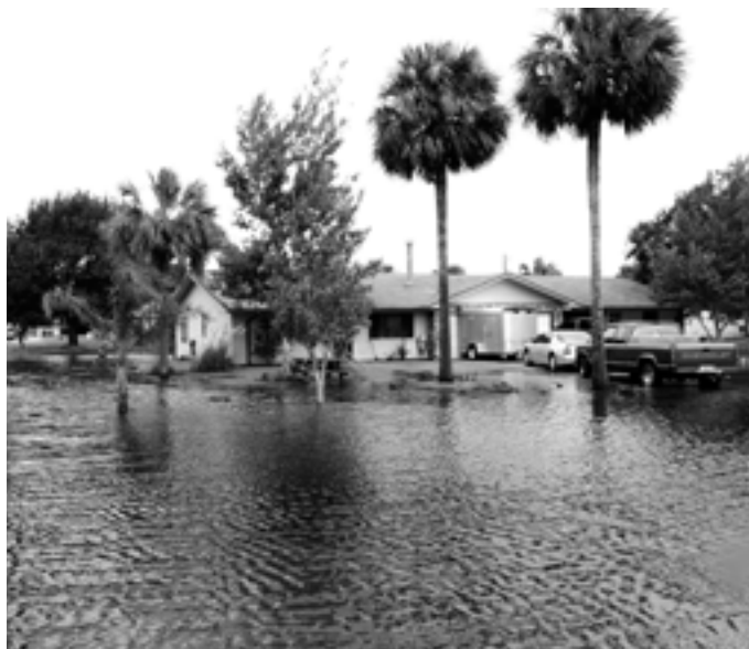
Florida Flooding.