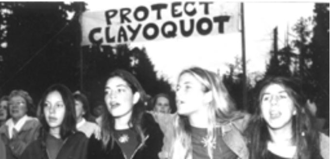
Young women protect Clayoquot Sound in 1993.

We can also heed the call from Dave Archambault II, Tribal Chairman of Standing Rock: divest from the banks which finance the desecration; boycott the corporations which provide the materials; join the campaign “to kill the black snake financially.” The Black Snake, of course, is not just one pipeline; it’s a vast web of pipelines ensnaring the earth and desecrating the lands of a newly risen continental alliance of First Nations. Nor are they merely pipelines—they’re life support for a snake with many heads.