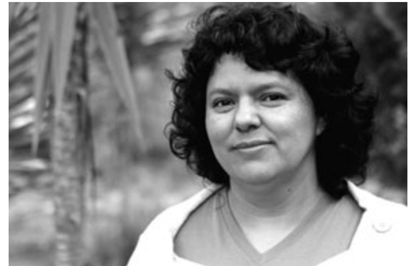
Berta Cáceres, a Honduran environmental activist killed in April 2017.

In the United States, we often forget that when we are called to the streets, write a letter of protest, boycott, give up some aspect of our lifestyle, there are those in other parts of the world where a demonstration is life-