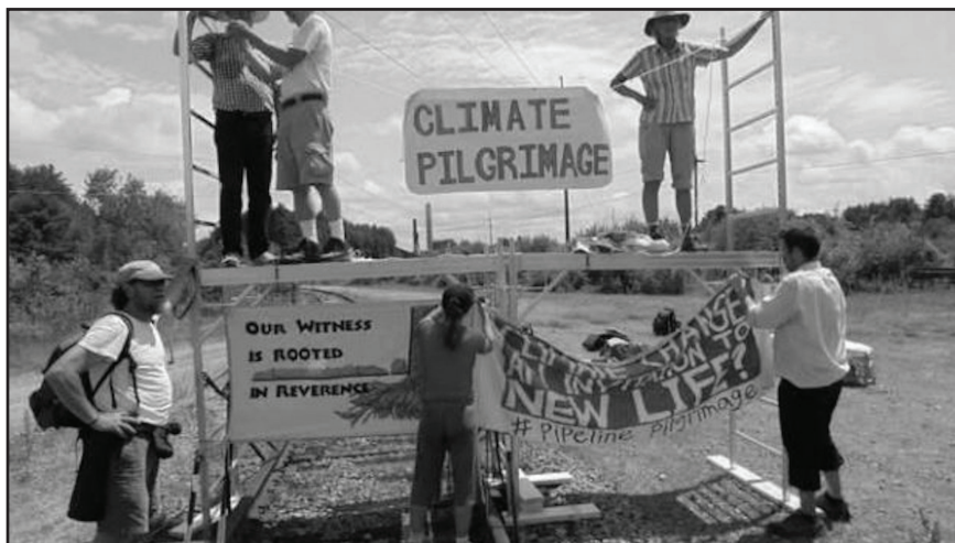
The group set up a 24-hour blockade on the railroad tracks that bring coal to the power plant in Bow. Thirteen members spent the night on the tracks.

There were about ten of us there that morning (the others had gone to worship at Concord meeting for their regularly scheduled worship service). It was sunny and hot and we were sitting on wooden boards covered by sleeping pads crowded into a small space under the scaffolding. We read the parable of the sower, prayed for our own willingness to do what is needed to