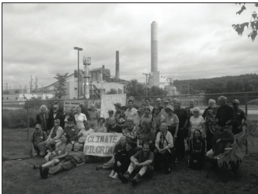
From the Climate Pilgrimage's Twitter account: “Over 50 NE #Quakers & fellow travelers gathered in worship & prayer to rejoice in life of the spirit bubbling among us #rootedinreverence.”

I chose to join the pilgrimage because it was clear to me that it was not a “protest” but rather an opportunity to gather in the manner of Friends with a common concern and listen for how the Spirit might be leading us into transformation both as individuals and as a group. There is so much I can say about this journey, but what is sticking with me the most is my experience in worship on the final morning of our time together, and the implications that that experience has