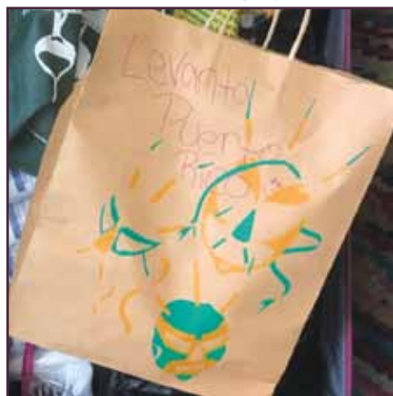
Bag of seeds en route to Puerto Rico with the mother of a NSNP gardener.

What an honor, what an excitement, what a calling—yes, seeds!