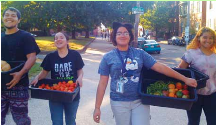
Raíces de Cambio (Roots of Change) Youth Garden crew with harvest, Fall 2017

I've been working as the Urban Garden Manager at Norris Square Neighborhood Project (NSNP) since March 2015. NSNP has an incredible history and legacy, and I am grateful to continue to steward six garden spaces started by Grupo Motivos, a grassroots group of Puerto Rican women. Gathering together since the 1980s, Grupo Motivos cultivated and curated over 12 cultural gardens from