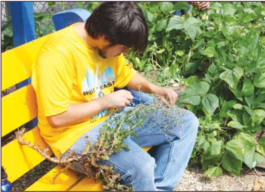
A Norris Square Neighborhood Project youth saves seed from cilantro plants.