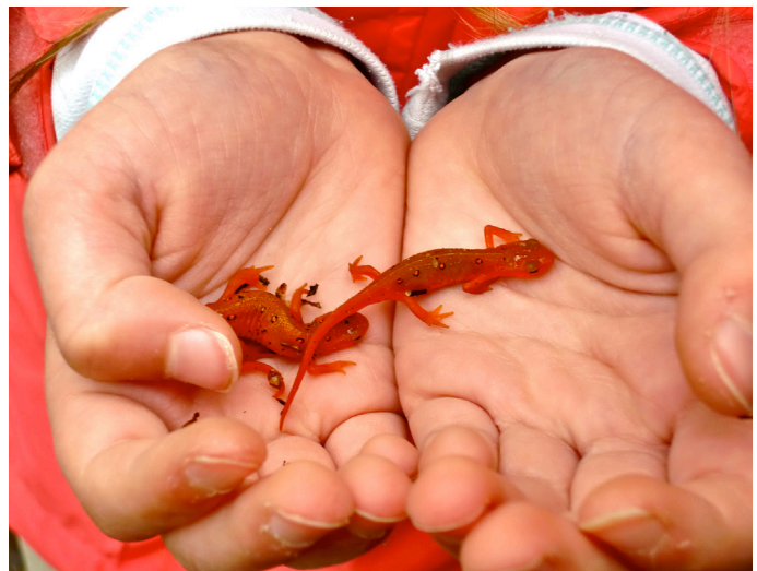
Two red efts.

I would carefully pick up the eft, cup it in my hands, and wait for the hush of anticipation. I’d explain how this amphibian was the land stage in the life cycle of