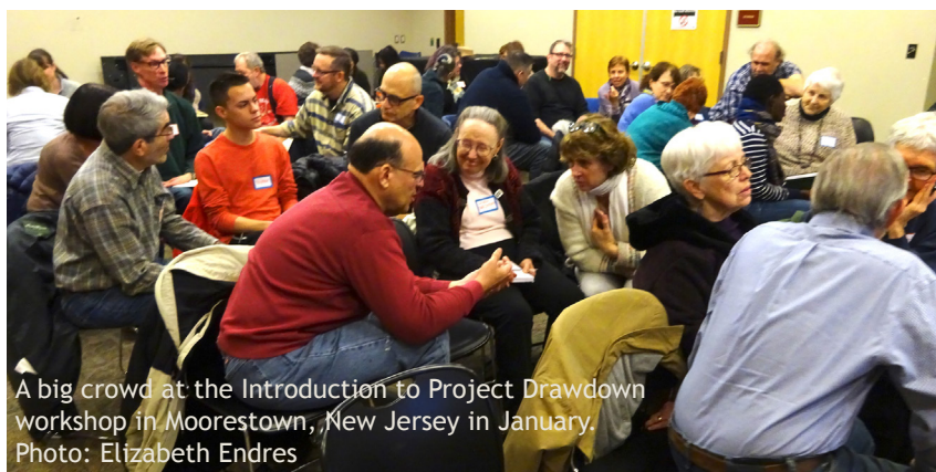
A big crowd at the Introduction to Project Drawdown workshop in Moorestown, New Jersey in January.