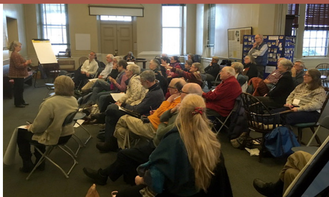
How to cut our carbon emissions in half over the next ten years?