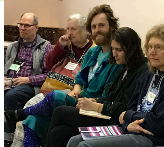
Friends of many ages gathered at Quaker Center in January.