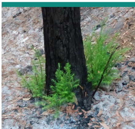
Young Redwoods sprouting out of a burned-out tree.

Because this fire occurred after such a long period of sustained growth in this mixed redwood/evergreen forest, it burned especially hot. It is not yet clear how well these areas will recover on their own. The natural ecosystem can rebound from more frequent and less intense fires, with the help of seeds and roots stored in the soil. Additional sunlight and fertilizer from ash might actually produce a healthier understory. However, the forest may need some help in recovery with mulching and seed planting, because in many places the hot fire burned most of the duff layer of soil. The biggest concern right now is erosion when