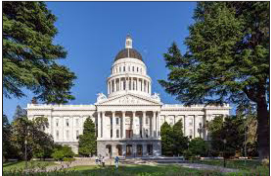
The Capitol Building in Sacramento, California

An example of where compromise was tried and failed is Senate Bill 100, which would have strengthened the state’s already impressive climate-change legislation by requiring a 50 percent reduction in greenhouse gas emissions by 2016, a 60 percent reduction by 2030, and a 100 percent reduction by 2045.