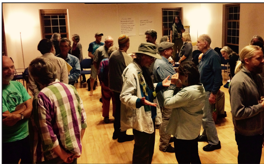
QEW supporters share their vision for our future at Pendle Hill in October 2017

We envision a world that takes as its guiding principles the ultimate value of clean, fresh water and healthy air for all beings; a world that sustains healthy ecosystems; a world that treasures our spiritual connection to the natural world; and a world that embraces environmental justice at its core. Join us in working together to call forth this shared vision of a better world. We create our vision with the light we shine and are grateful for your light!