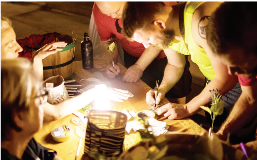
Neighbors gather for Grove of Life event

AN ALL-NIGHT, OUTDOOR EVENT. One thousand passersby publicly claim their practices and promises to reduce climate change. Each attaches a paper leaf with a personal, hand-written testimony like “bicycle everywhere,” “no food waste,” “share housing,” “travel by train” to a branch on a small grove of trees, the Grove of Life.