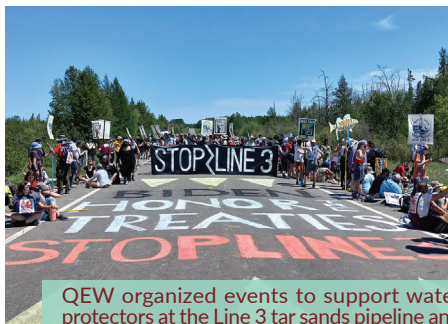
QEW organized events to support water protectors at the Line 3 tar sands pipeline and visited the resistance camps in MN.

We also collaborate with Quaker partner organizations, the larger environmental justice movement, and faith-based networks.