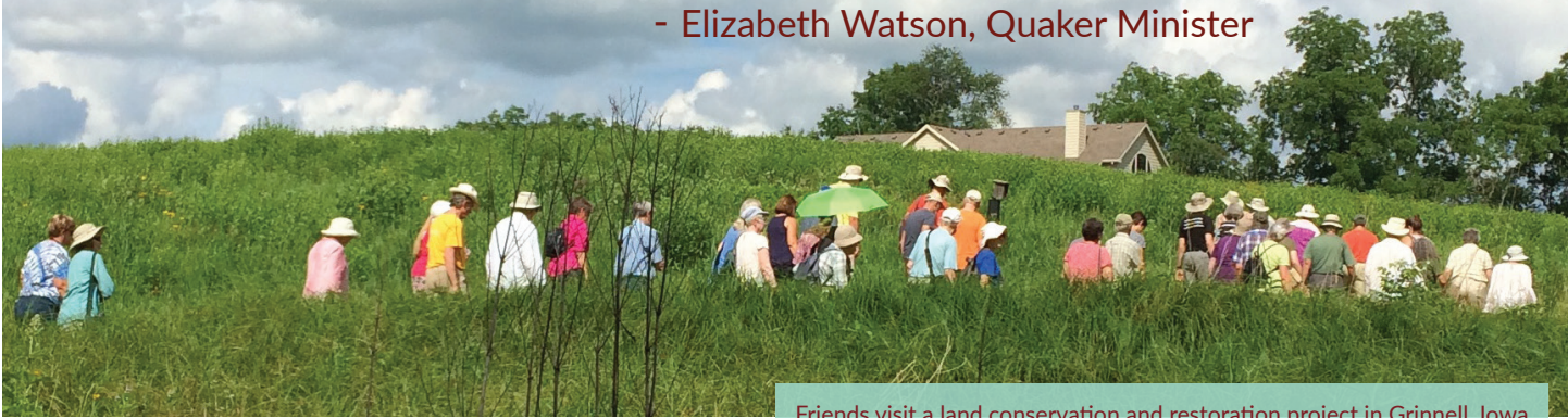
Friends visit a land conservation and restoration project in Grinnell, Iowa.