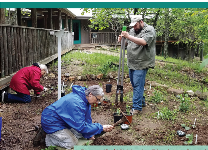
Fayetteville (AR) Meeting Friends install a native plant garden with help from a QEW Mini-Grant.