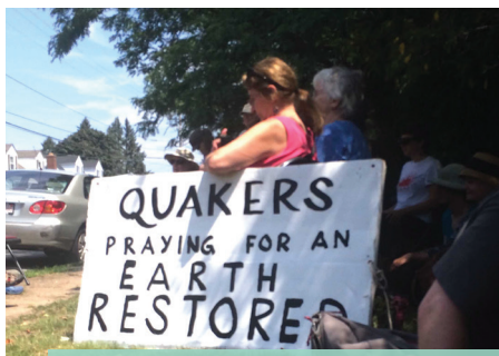
QEW staff joined New England Friends in protest of a new gas plant.