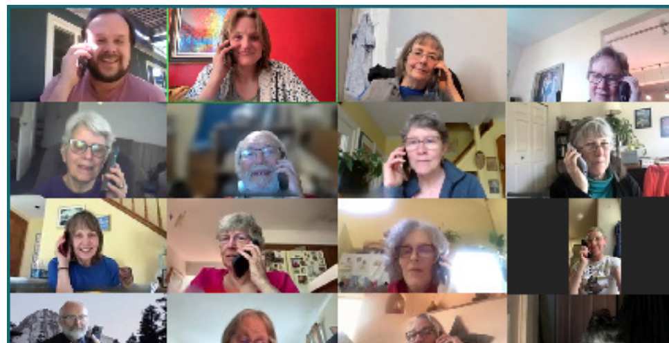
QEW Action Call Protect our Earth | Save the IRA

Beyond the numbers, volunteers reported that the campaign taught them to frame climate action in terms that resonated with their neighbors, to ground activism in prayer and song, and to value data-driven strategies. As one reflected, “our community learned that we have a role as people of faith to build political power and that strategic analysis can make a difference.”