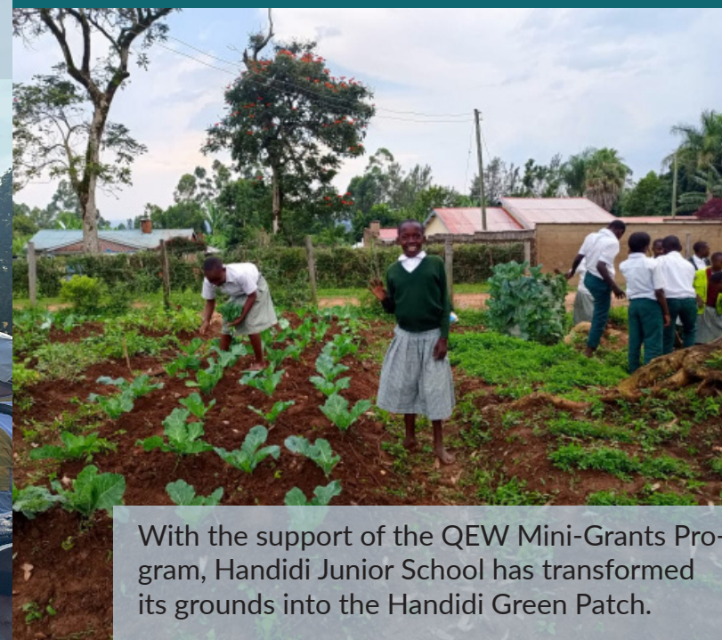
With the support of the QEW Mini-Grants Program, Handidi Junior School has transformed its grounds into the Handidi Green Patch.

What is emerging is more than an expansion of QEW's work; it is the beginning of a new center of gravity for Earthcare within the Quaker world. In Kaimosi, Kenya, Friends are envisioning a hub for Earthcare education, training, and community life. The East Africa Yearly Meeting contributed land for this project, which is shaped by African leadership and grounded in local realities.