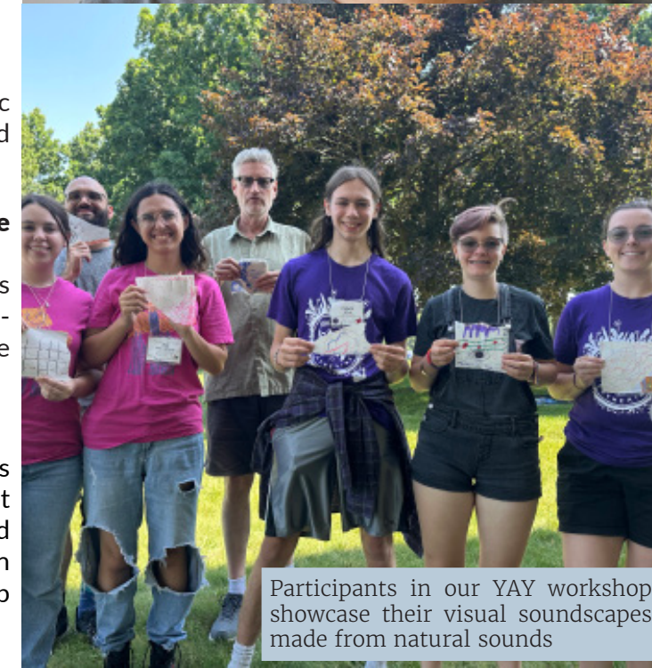
Participants in our YAY workshop showcase their visual soundscapes made from natural sounds