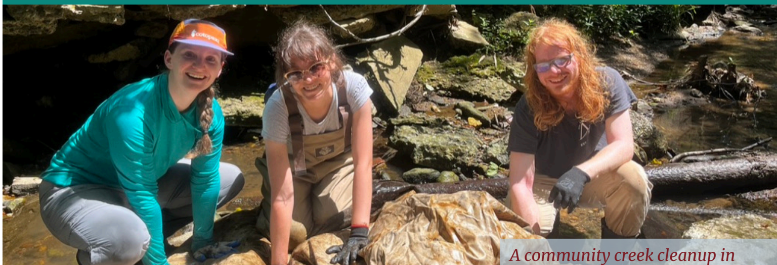
A community creek cleanup in Asheville, North Carolina